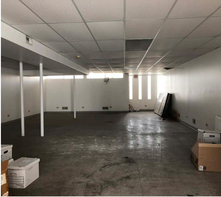
Vanilla Box Space