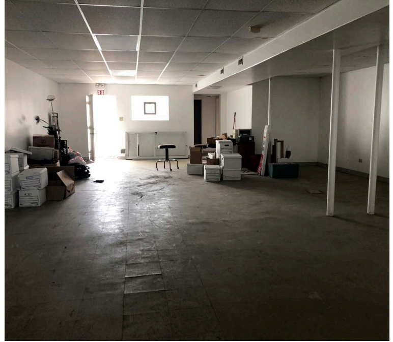
Vanilla Box Space