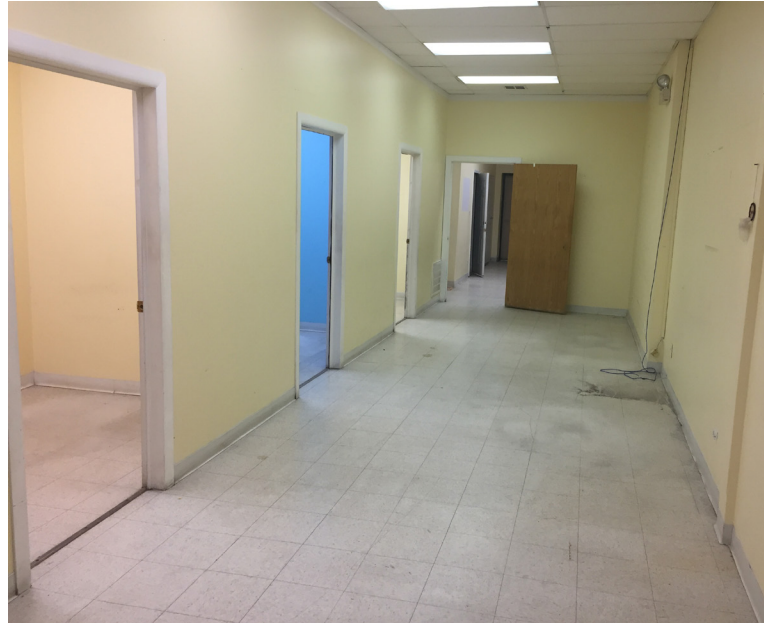
Hall with Offices