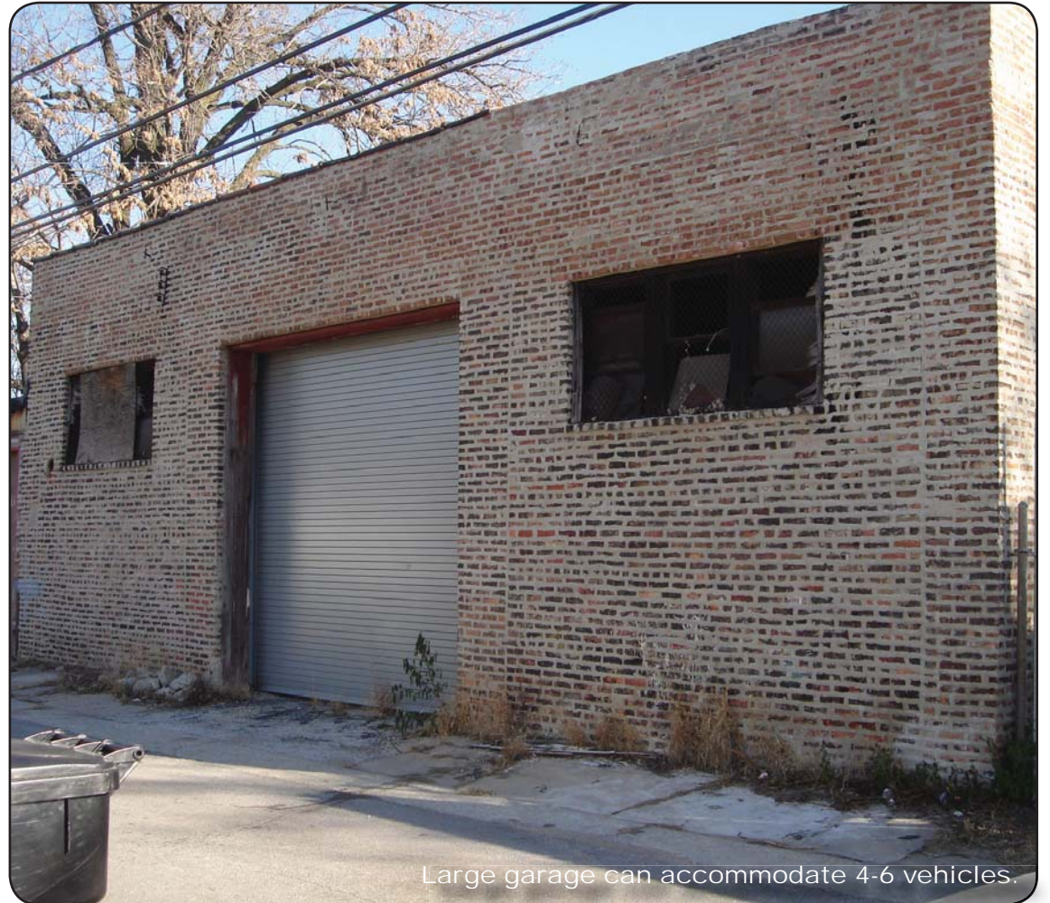
Large garage can accommodate 4-6 vehicles.