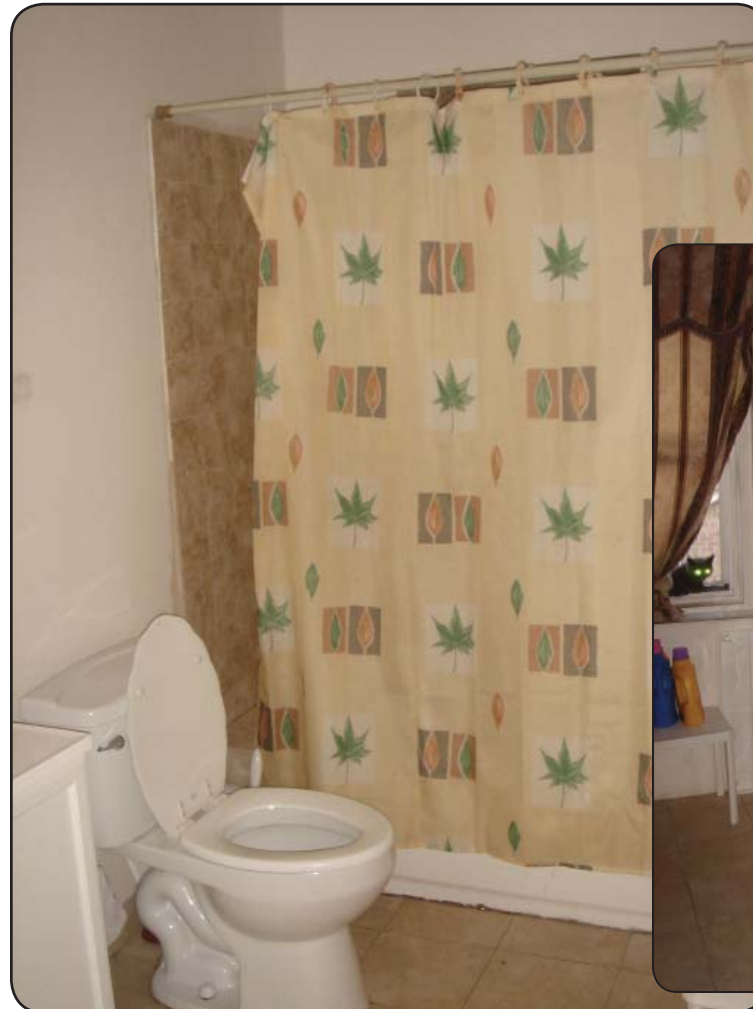
Left: Retail Space Middle: Recently rehabbed apartment bathroom Right: Apartment has a laundry room with a wash tub.